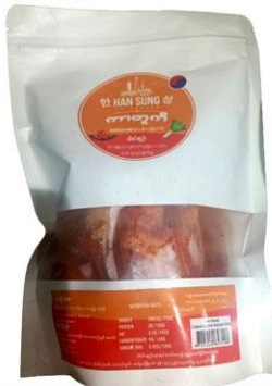
526919 HANSUNG RADDISH KIMCHI (CUBE) 350G