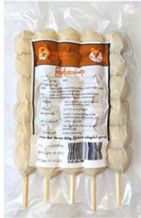
519688 GCB CHICKEN BALL SKEWER 500G