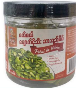
527735 MAL MAL PETAI IN BRINE 200G