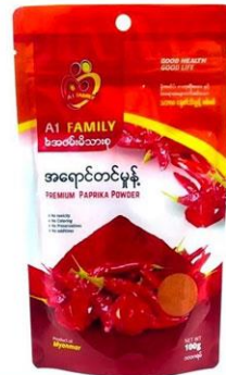
507789 NEW A1 PAPRIKA POWDER 1.6KGX1