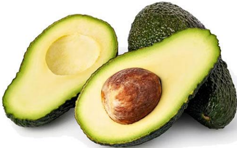
509447 PINKERTON AVOCADO KG