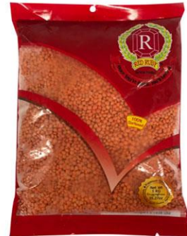
507939 RED RUBY RED LENTIL BEAN 1KGX1