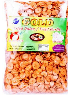
507713 GOLD FRIEDGARLIC_DINGAR 100GX4