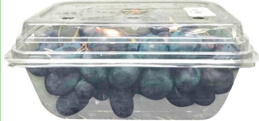
515645 CN RED SEEDLESS GRAPE 500G PACK