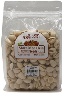
507892 SMH ROASTED PISTACHIOS 500GX1