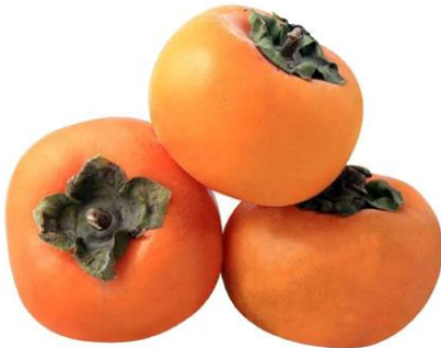
96980 PERSIMMON -WEIGHT KG