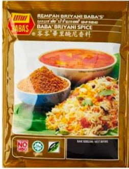
522596 BABA BRIYANI CURRY POWDER 70G