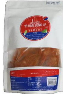
525326 HANSUNG CABBAGE KIMCHI (CHOP) 350G